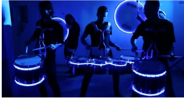
Hitmen Drumline (4 drummers) $4,750