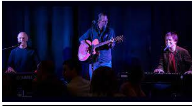
Dueling Pianos Ottawa $5,000

Each unique show features an endless series of classic hits spanning decades of music. Playing a blend of requests from the audience, blistering guitar and piano solos, three-part harmonies, and random comedic impromptu moments, their show has won over the crowds they perform for time after time.